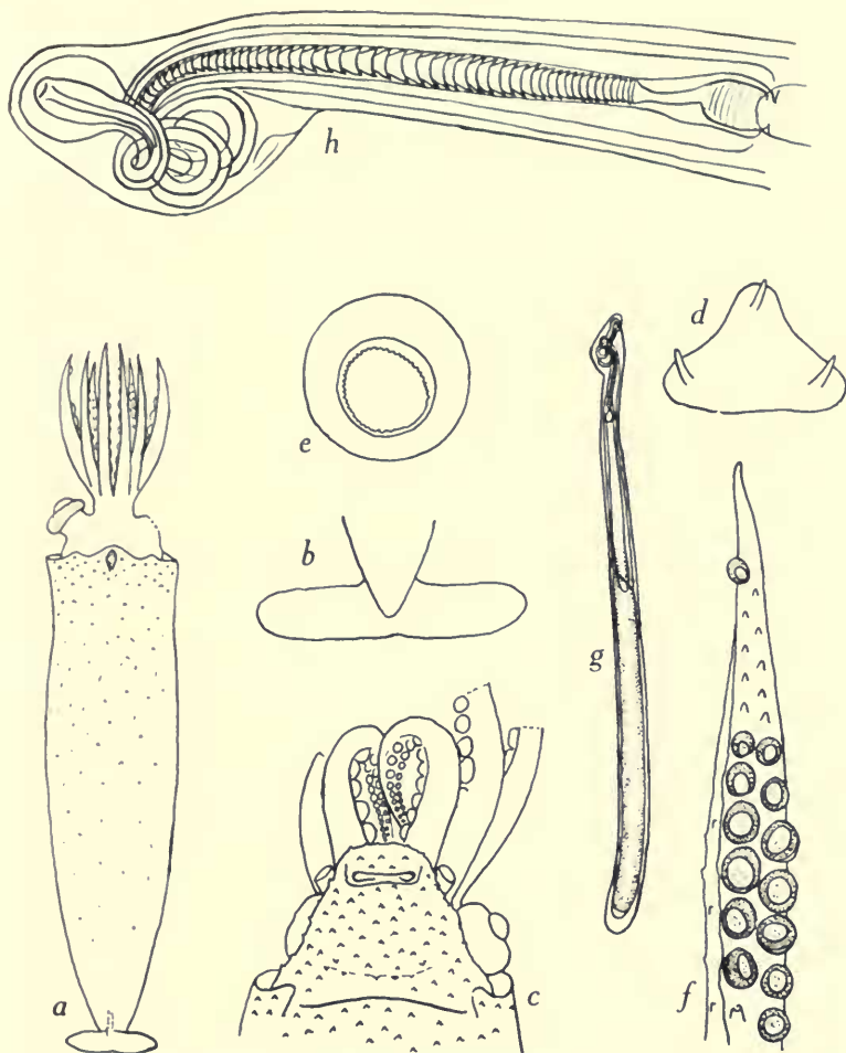
FIG. 74. Megalocranchia papillata , new species. a , Dorsal view of holotype; mantle length 40.0 mm. b , Ventral view of fins, showing attachment. c , Funnel. d , Dorsal member of funnel organ. e , Ninth ventral sucker of second left arm. f , Oral view of left third arm. g , Semi-diagrammatic drawing of spermatophore; length 7.4 mm. h , Details of horn and mid-organ of spermatophore; length 1.1 mm.

The head is small and somewhat injured. Only the left eye is present. The eye is of moderate size and in the single specimen has no light organ that can be distinguished as such.